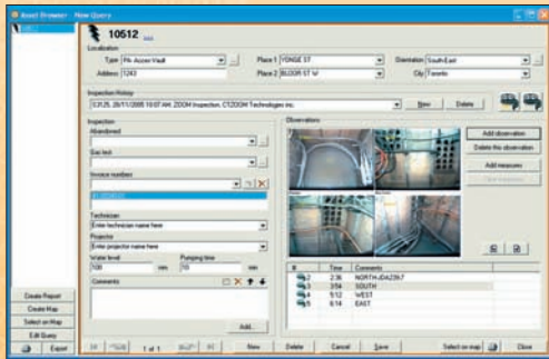
Electrical vault inspection record