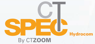
Image management solution for inspection of electrical or communication underground vaults and structures

Exclusive to CTZoom Technologies, CTSpec Hydrocom's integrated automatic file-burning module enables complete same-day reporting on the condition of inspected facilities right in the inspection unit. No chance of human error. No risks.