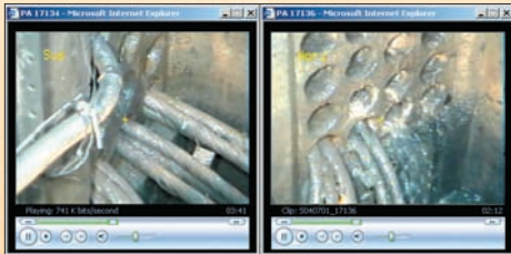
Multi-window viewing of targeted videos with on-screen annotation